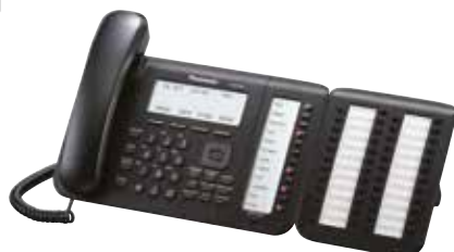
Photo: KX-NT556 with KX-NT505